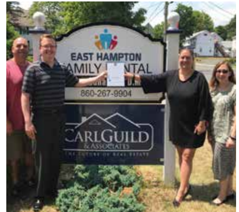
Carl Guild & Associates.