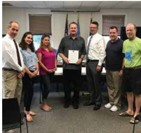
Swept Away Cleaning LLC.