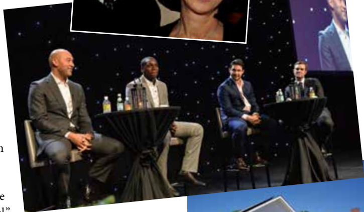
New location, right, at 15 North Main Street in Old Saybrook.